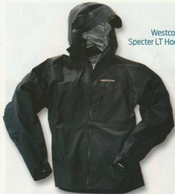
Westcomb Specter LT Hoody

Rab and Westcomb products are not yet widely available at U.S. retail stores. Check online retailers such as backcountry.com and prolightgear.com.