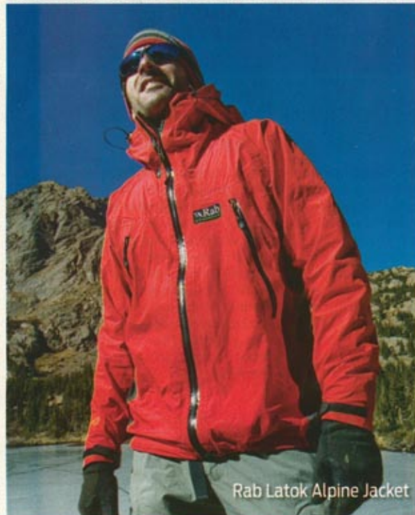
Rab Latok Alpine Jacket