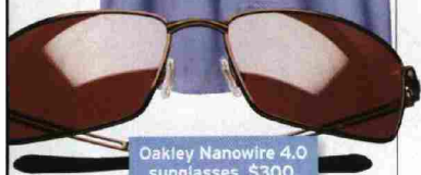
Oakley Nanowire 4.0 sunglasses, $300. Below: Llamas in the Cordillera Colán mountains of Peru.