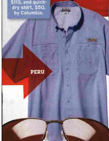
From top: Stretch anorak, $115, and quick-dry shirt, $50, by Columbia.