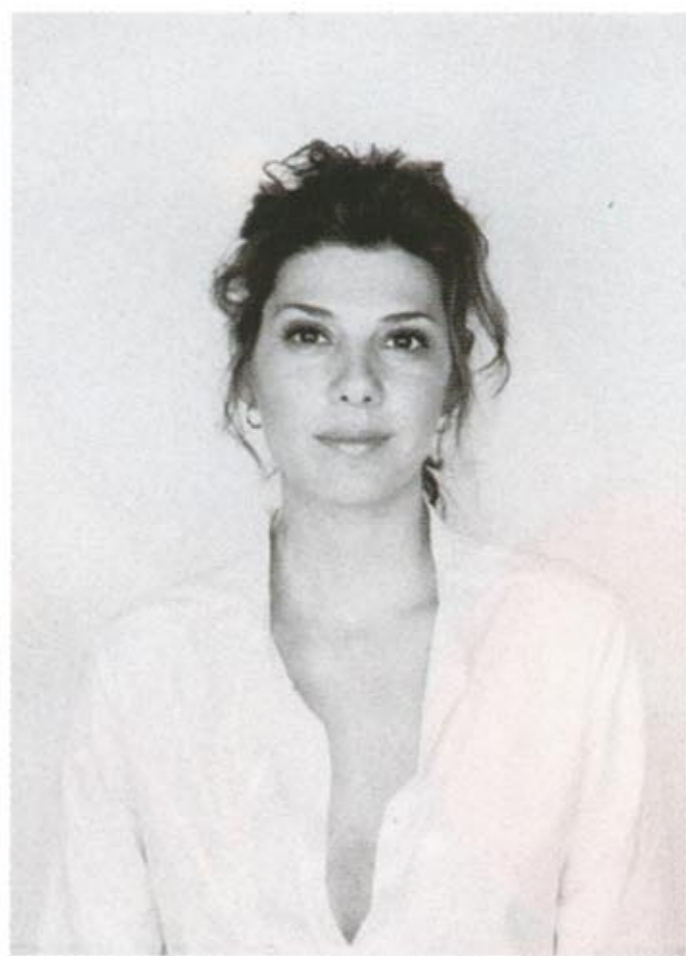
Give this woman another statue.