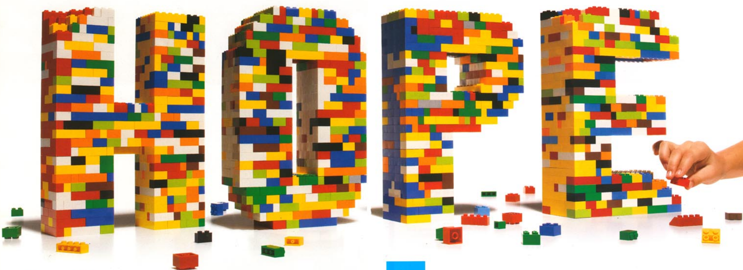
54 GQ 02.2009

We know you've had a million reasons to feel doom and a certain gloom lately. We also ▶▶