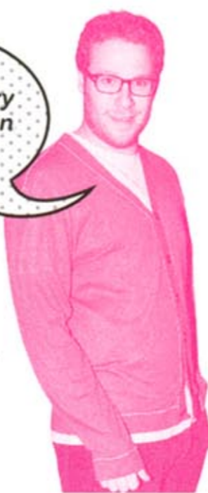
Seth Rogen, too thin